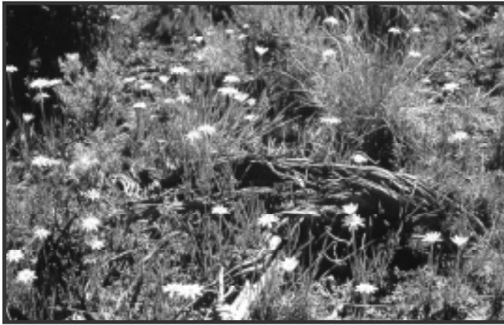
This Agoseris, or mountain-dandelion, is “sage grouse ice cream.” It’s one of many forbs that grouse and other wildlife eat.