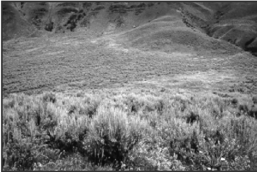
Michael Mancuso, Idaho Conservation Data Center

To many of us, sagebrush country symbolizes the wild, wide-open spaces of the West, populated by scattered herds of cattle and sheep, a few pronghorn antelope, and a loose-knit community of rugged ranchers. When you stand in the midst of the arid western range, dusty gray-green sagebrush stretches to the horizon in a boundless, tranquil sea. Your first impression may be of sameness and lifelessness—a monotony of low shrubs, the over-reaching sky, a scattering of little brown birds darting away through the brush, and that heady, ever-present sage perfume.