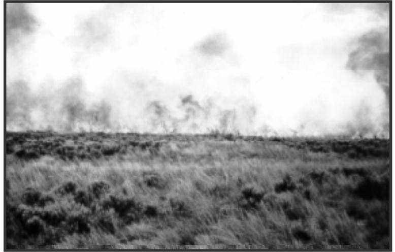
Fire was, and still is, an important part of the sagebrush shrubland ecosystem. Part of the mosaic pattern in sagebrush is due to fires, which tend to burn in patches, creating stands of sagebrush of varying ages.

After a fire, big sagebrush must be re-established by wind-dispersed seed or seeds in the soil. Most sagebrush seeds fall within 1 m (3 ft) of the shrub