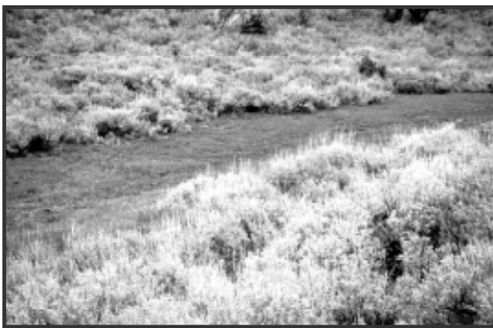
Springs, wet meadows, and riparian areas within sagebrush shrublands add diversity. They provide water, succulent forbs, and abundant insects for many wildlife species. Sage grouse rely on these areas in the brood-rearing period.

We cannot overstate the importance of healthy plant communities around streams, ponds, springs, seeps, wet meadows, and wetlands to birds and other wildlife, especially in arid country. These areas provide water, abundant insects and forbs for eating, and grasses and forbs for cover. Water developments for livestock or wildlife can use water that is already available (such as springs and seeps) or harvest water that is otherwise unavailable (such as wells and catchments). Be sure to evaluate the benefit of water developments against their effect on aquatic and riparian vegetation, the water table, and potential for attracting undesirable animals or plants.