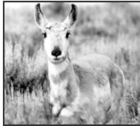
Environmental Science and Research Foundation

shrubs and grasses (Peterson 1995). Pronghorn, pygmy rabbits, and sage grouse may eat exclusively sagebrush in winter, and sagebrush also becomes a major portion of mule deer and elk diets. Taller sagebrush provides cover for mule deer and sage grouse (Dealy et al. 1981), and the crowns of sagebrush break up hard-packed snow, making it easier for animals to forage on the grasses beneath (Peterson 1995). Throughout the rest of the year, sagebrush provides food for pygmy rabbits and sage grouse; protective cover for fawns, calves, rabbits, and grouse broods; and nesting sites for many shrub-nesting birds. The sage thrasher, Brewer's sparrow, sage sparrow, and sage grouse most frequently nest in or beneath sagebrush.