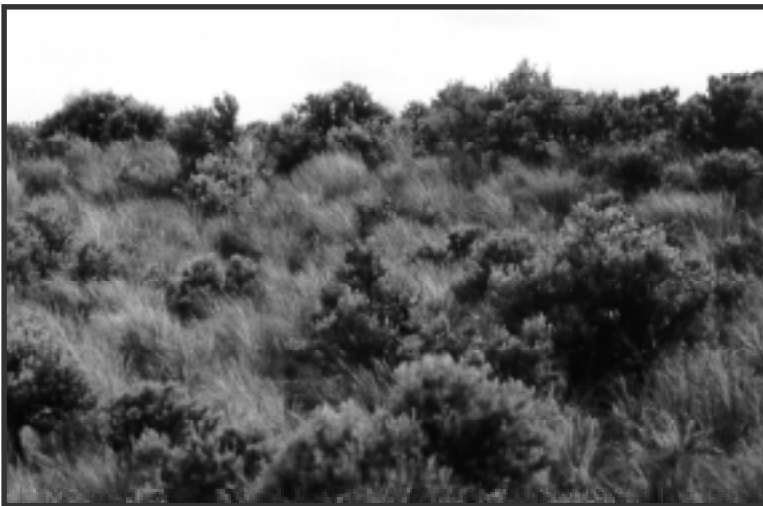
Diane Romayne, IDFG

Biological soil crust is an integral and usually overlooked component of sagebrush shrublands. It creates a rough crust on the soil surface in semi-arid habitats. Biological soil crust (also known as “cryptobiotic crust,” “microbiotic crust,” or “cryptogamic soil”) is a fragile microfloral community composed of blue-green algae, bacteria,