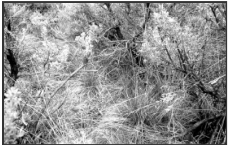
This native grass understory within big sagebrush is excellent nesting cover for sage grouse and other ground-nesting species. These birds use native grasses and forbs to construct their nests, shade them, and hide them from predators.