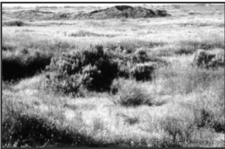
Of all the changes that have occurred in sagebrush shrublands, the invasion of non-native cheatgrass is probably the most harmful. This photo, taken in June, shows the almost continuous fuel chain created by cheatgrass.

The greatest change to sagebrush plant communities came with the invasion of non-native annual grasses