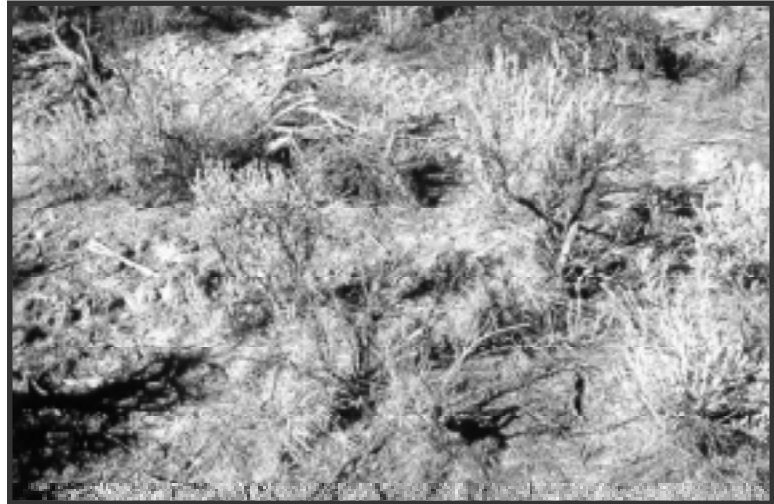
Excessive grazing removes the grasses and forbs between and even under the shrubs. Grazers also trample the soil and occasionally a ground nest.

Bob Moseley, Conservation Data Center, IDFG