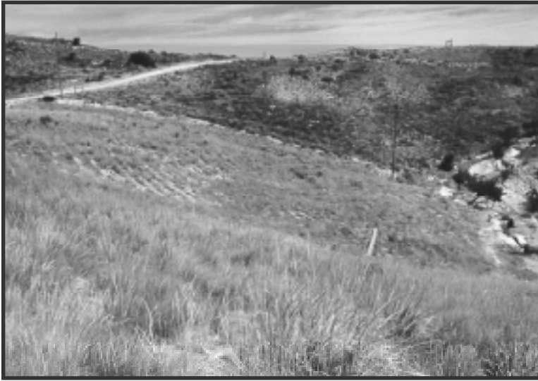
John Erickson, Wyoming Dept. of Environmental Quality

This shrub reestablishment area at the Skull Point Mine in Wyoming is contoured to blend in with the native habitat. Variation in topography will result in a mosaic similar to what occurs in an unmined area. Sagebrush can be reestablished from wind-blown seeds, seeds stored in topsoil, a seed mix, or transplanting shrubs. This site is about 7 years old.