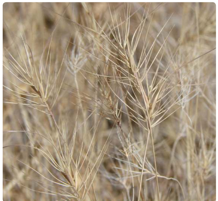
Figure 1: Medusahead seed head in an invaded area.