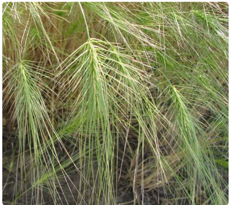
Figure 1. Medusahead in an invaded area.